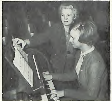
Music—Listening And Learning